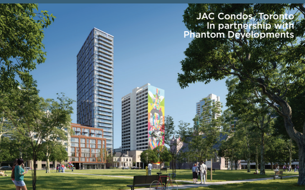
JAC Condos, Toronto In partnership with Phantom Developments