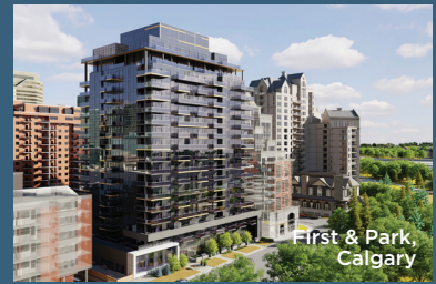
First & Park, Calgary