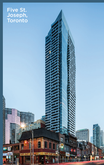
Five St. Joseph, Toronto