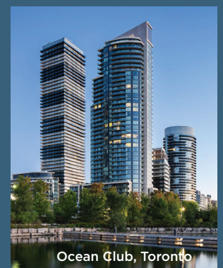
Ocean Club, Toronto