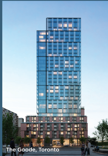
The Goode, Toronto

With a discerning eye for exceptional areas that are highly sought-after and carry great growth potential, our team works to select only the best in Triple A locations. Here are a few of our latest successful projects.