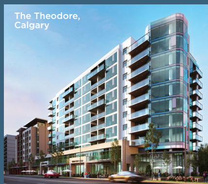
The Theodore, Calgary