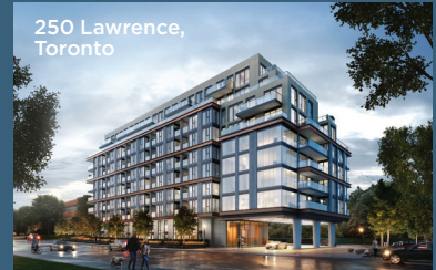
250 Lawrence, Toronto