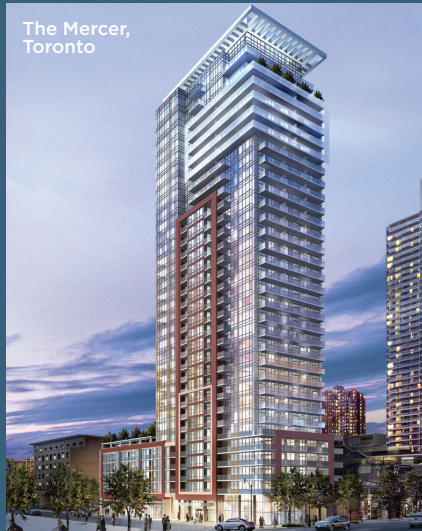
The Mercer, Toronto

Graywood homes are built to last with a solid foundation of investment, construction, and development expertise.