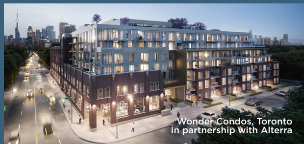
Wonder Condos, Toronto In partnership with Alterra